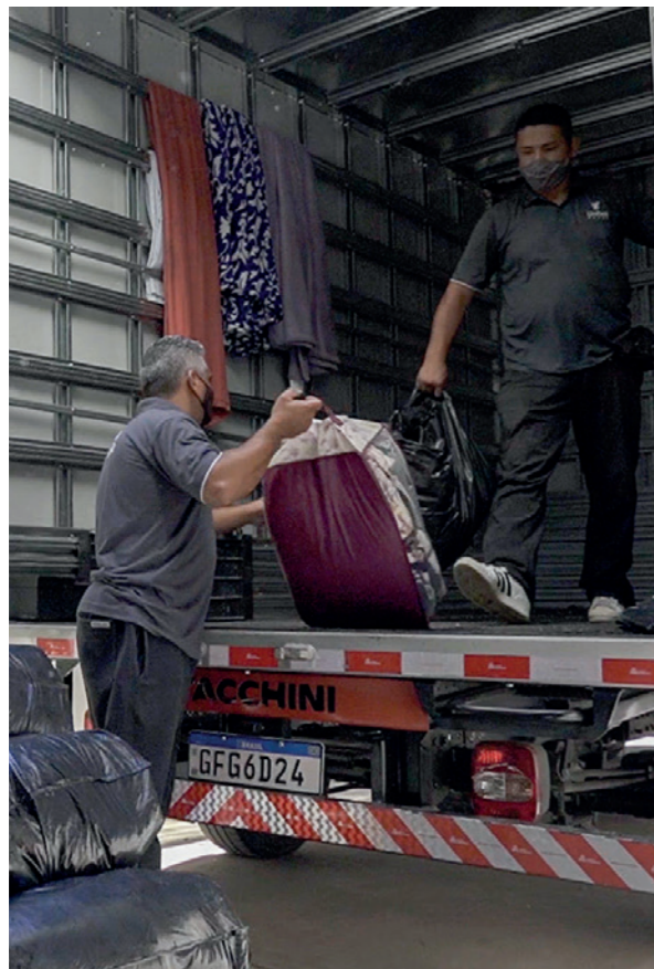
Picking up donations