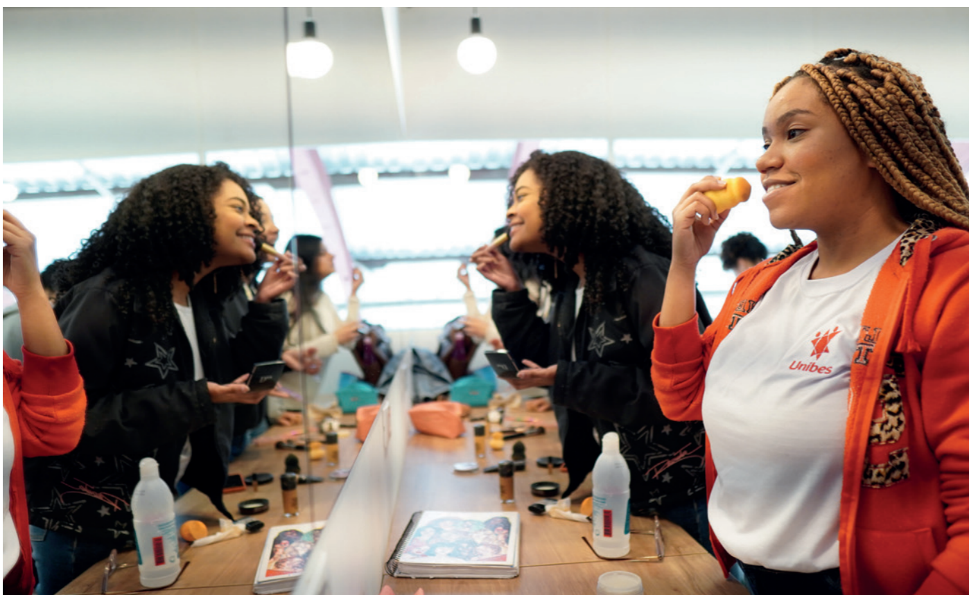
Young people participating in the make-up and self-esteem class