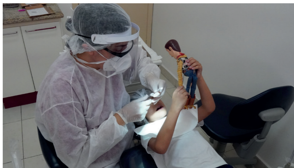
On-site dental treatment and recreational activities

activities with games, storytelling, reading and art, as well as nutritional and dental assistance. This program tracks the growth of the children and provides the necessary support for them to develop in these early years of life with health, warmth, social interaction, and educational support. Playing and learning are important parts of the joy and social well-being of these children.