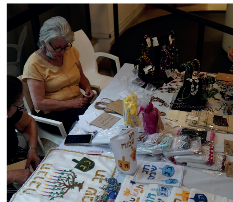
Developing autonomy and capabilities for income generation