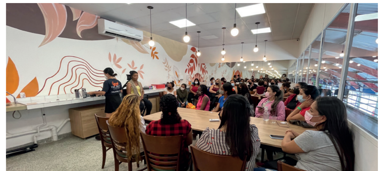
Action focused on women’s health: self-knowledge and autonomy