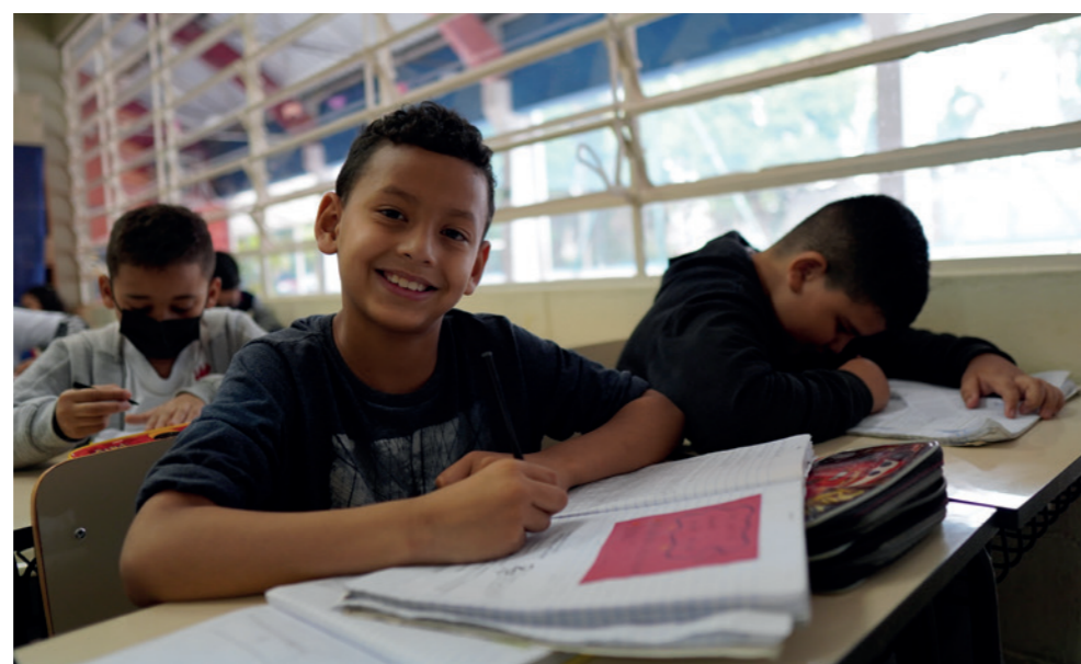
Students in class receiving educational support