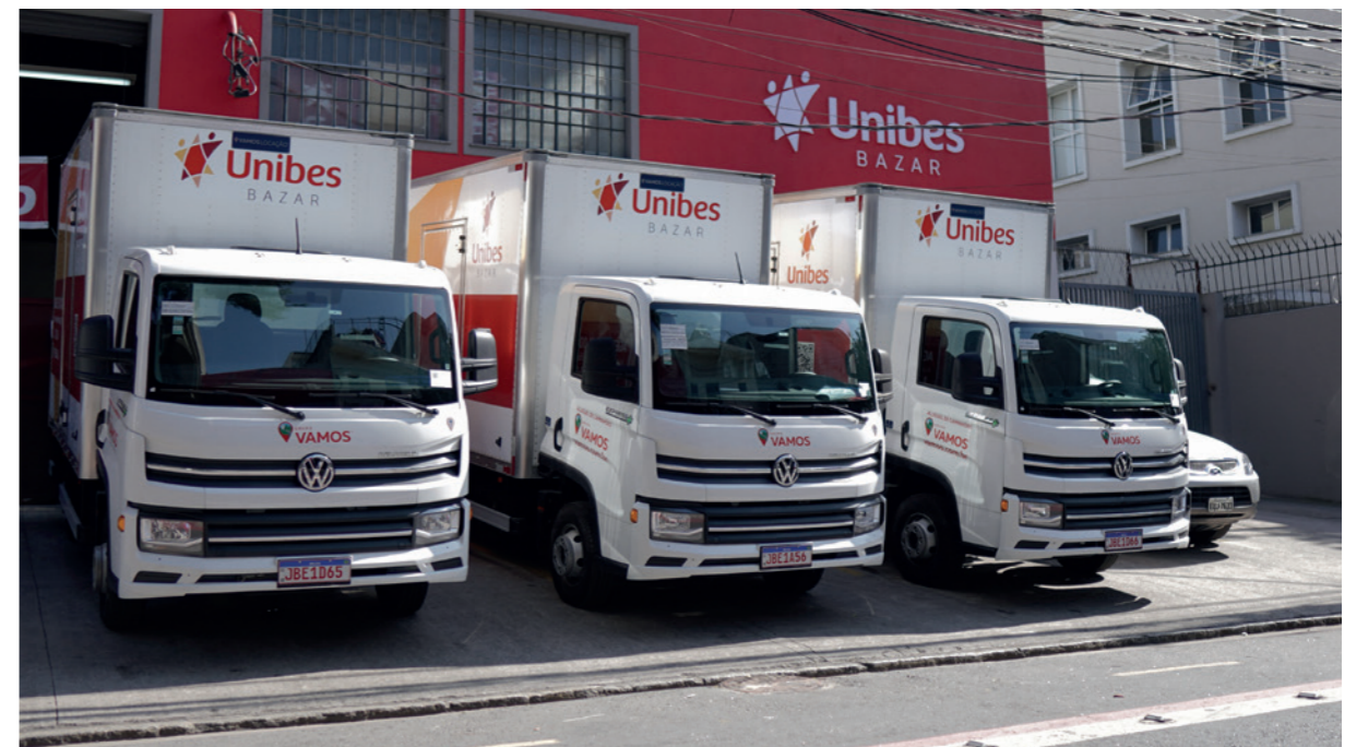
Fleet of truck for picking up donations