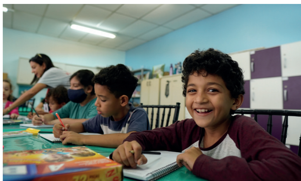
Painting workshops and recreational activities with the children

Taking into account the situation of the pandemic, courses for personal and professional development are being resumed, and the service continues to provide access to information on basic rights in the areas of education, health, and social security. DigiLab welcomes an average of 280 users every month.