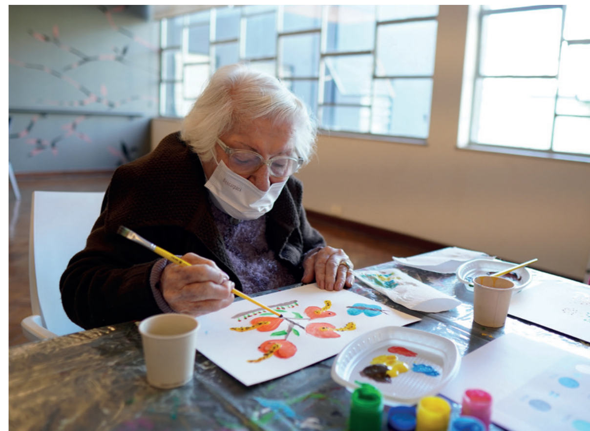
Elderly woman participating in an art workshop