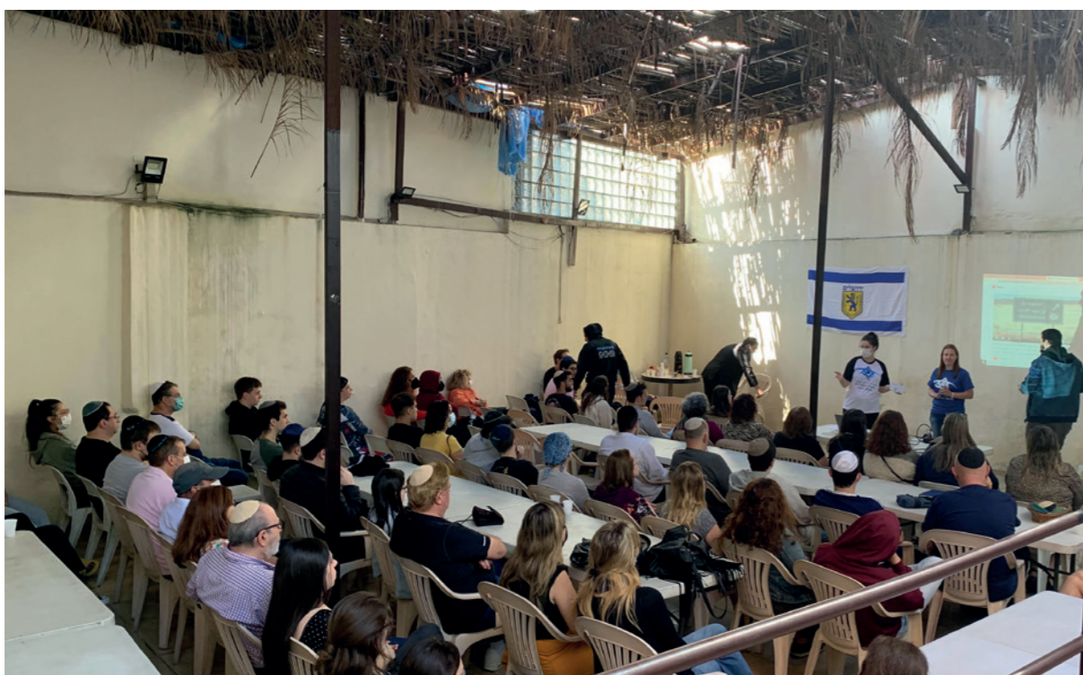
Meeting of young people from the Unibes University Program