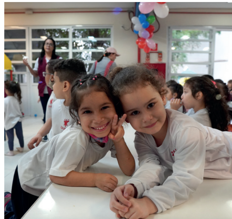
Children participating in recreational and educational activities