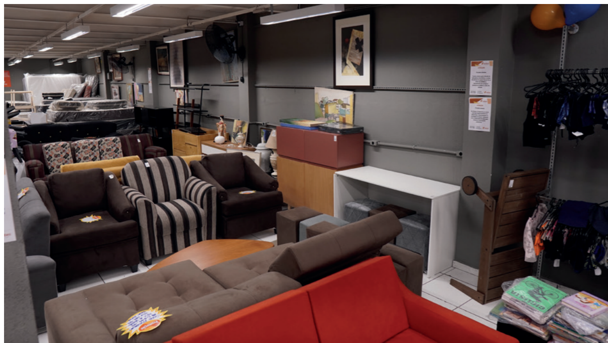
Unibes Bazar store - Lapa

Watch the video of the delivery of the trucks that were donated