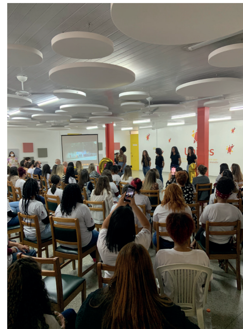
Graduation ceremony of the Girls Education Program

At Unibes, developing the autonomy of women in all phases of life is very important. And to strengthen the entrepreneurial sense and the empowerment of young female students of the Children and Adolescents Center, a partnership between Unibes and the Estée Lauder Companies Brazil, a global group of luxury cosmetics, started the Girls Education program, the first education and social responsibility project by Estée Lauder in Latin America. The program invests in high-performance education for students enrolled in one of the professional training courses or after-school programs offered by the Institution and impacts every year over 400 young women ages 12 to 17. There are two main pillars that constitute the program: Leadership Skills and Emotional Intelligence, so that the students can develop essential characteristics for the job market and identify their potential with self-awareness and self-esteem, receiving the necessary support to strengthen their emotional structure. In addition, they also develop new behavioral skills through dynamic workshops, group readings and videos, English and make-up classes that enhance their self-esteem and help them feel more confident in recruiting processes.