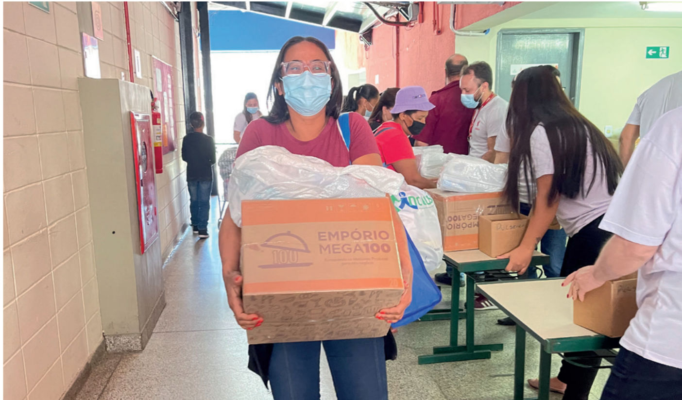
Distribution of basic food baskets to those assisted by Unibes

56,000 food baskets 12,500 food voucher cards 28,000 hygiene and cleaning products baskets