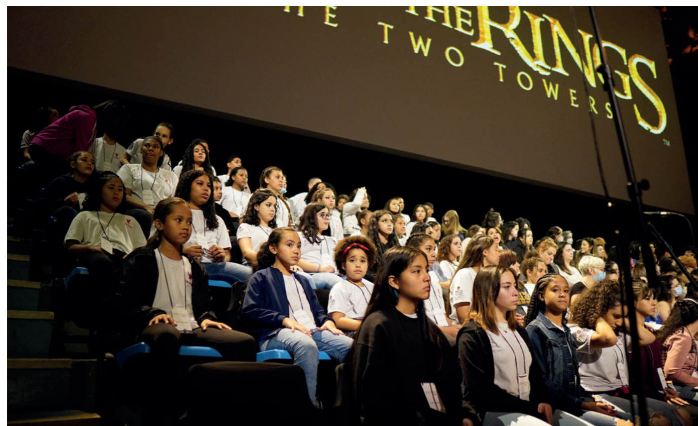
Children's choir performance at the Cine Concert The Lord of the Rings: The Two Towers

In 2022, there were some important events in the Children and Adolescents Area. There was the re-inauguration of the Matific room, a games and learning platform, in an environment that fosters the study of mathematics in a playful, dynamic and innovative way. There also was a performance by 50 students from the Unibes Children and Adolescent's Choir at the Cine Concert The Lord of the Rings: The Two Towers, alongside great professionals. This provided the young people with a great learning opportunity through culture.