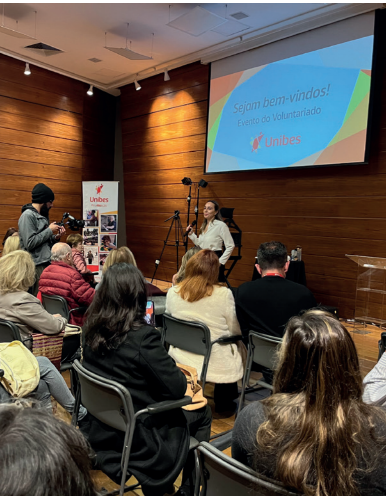
Volunteer event at Unibes Cultural