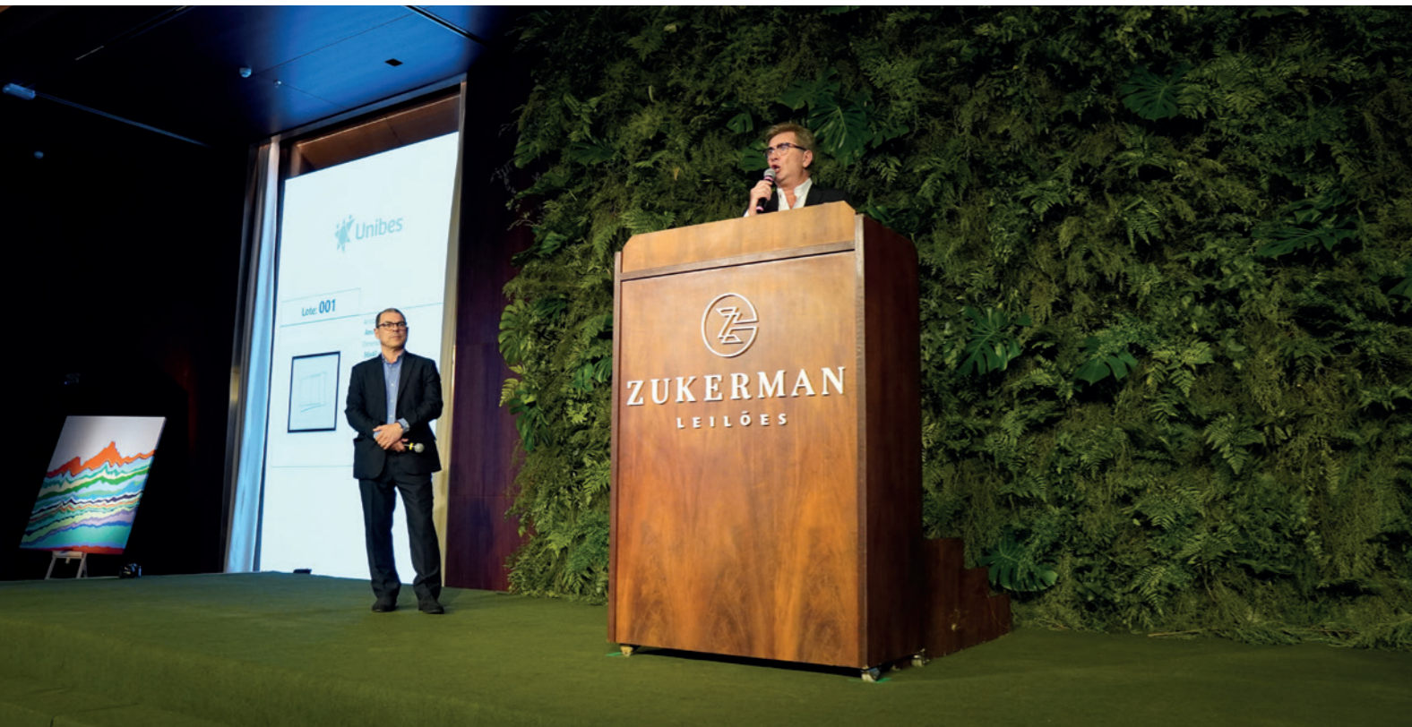
2nd Unibes Charity Art Auction “The art that enchants. The art that transforms”.