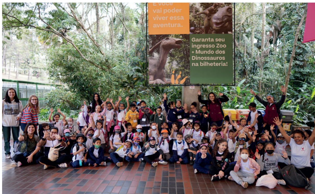
Cultural outing with the children