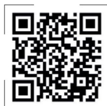
Watch the video of the graduation of the Professional Training Course CEDESP – 2nd semester