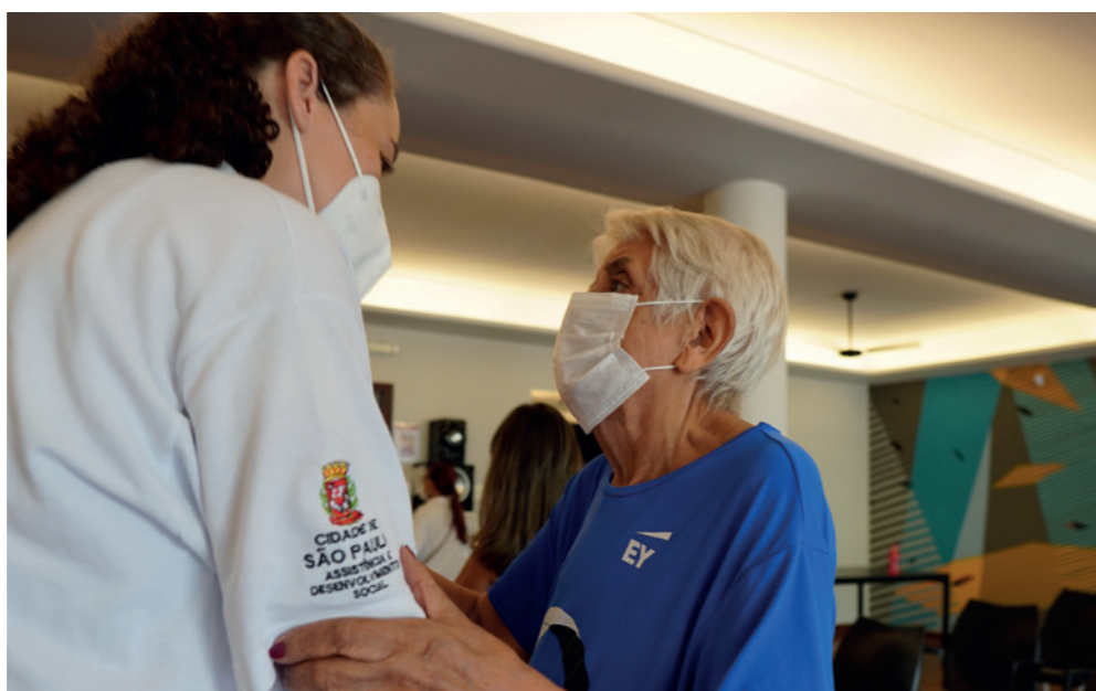
Activities such as painting, dancing and art therapy