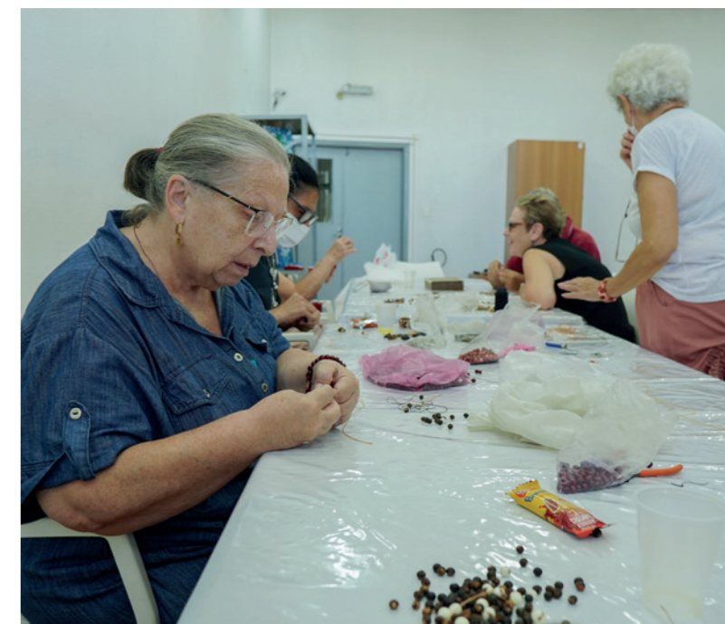
Manual workshops that stimulate creativity

The Kavod Program was created with the goal of developing new capabilities for individuals from the Jewish community who are in a situation of social vulnerability. Unibes receives the resources donated by the partner and promotes activities that will develop the autonomy of the participants, encouraging them through training workshops to become entrepreneurs and generate their own income. The multidisciplinary work is conducted by Unibes Social Services to identify the main capabilities of each person, so that they can be recommended for the right courses. The productive groups are divided among manual workshops that stimulate creativity and promote motor coordination and entrepreneurial activities, and culinary workshops that develop and teach effective food practices, showing the different processes related to food and the proper handling of food products up to the point of sale. Through this learning routine, the individual discovers himself as an active person, taking the lead in changing his own life and collaborating with the social environment around him. Two years after it was created, the Program currently has 252 participants, all of whom are developing their autonomy and income generation skills.