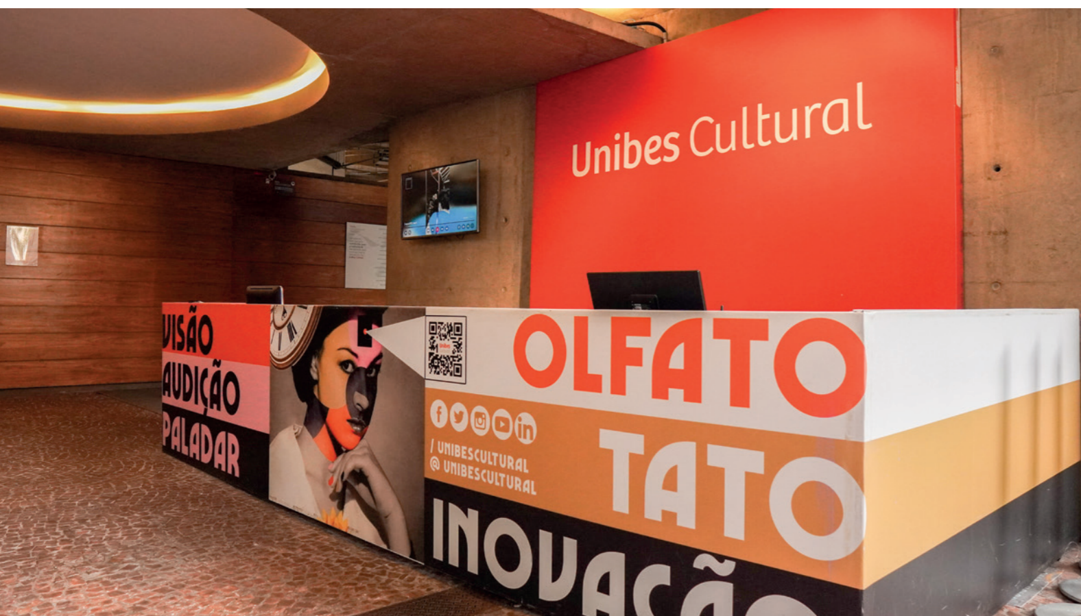
Reception and lounge at Unibes Cultural

42,000 in-person audience at general events