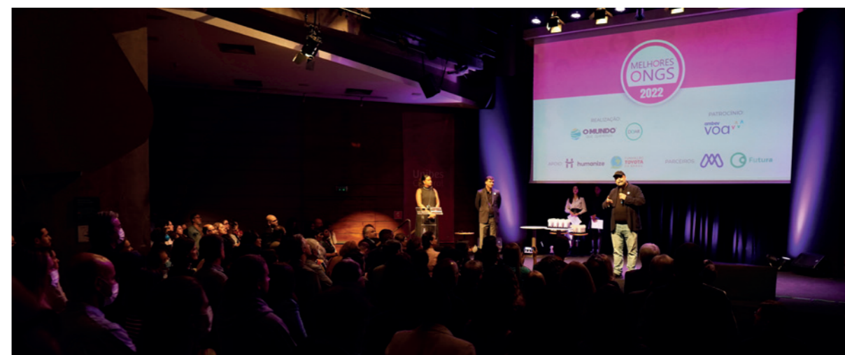
Unibes Cultural resumed its in-person activities with several events

Main events, courses, and workshops: Dialogue in the Dark Exhibition, Recycling Exhibition, Ucult Lab, Carpentry School, DOCSP. Main fairs: Misturô, Rosenbaum and Criativa Mente.