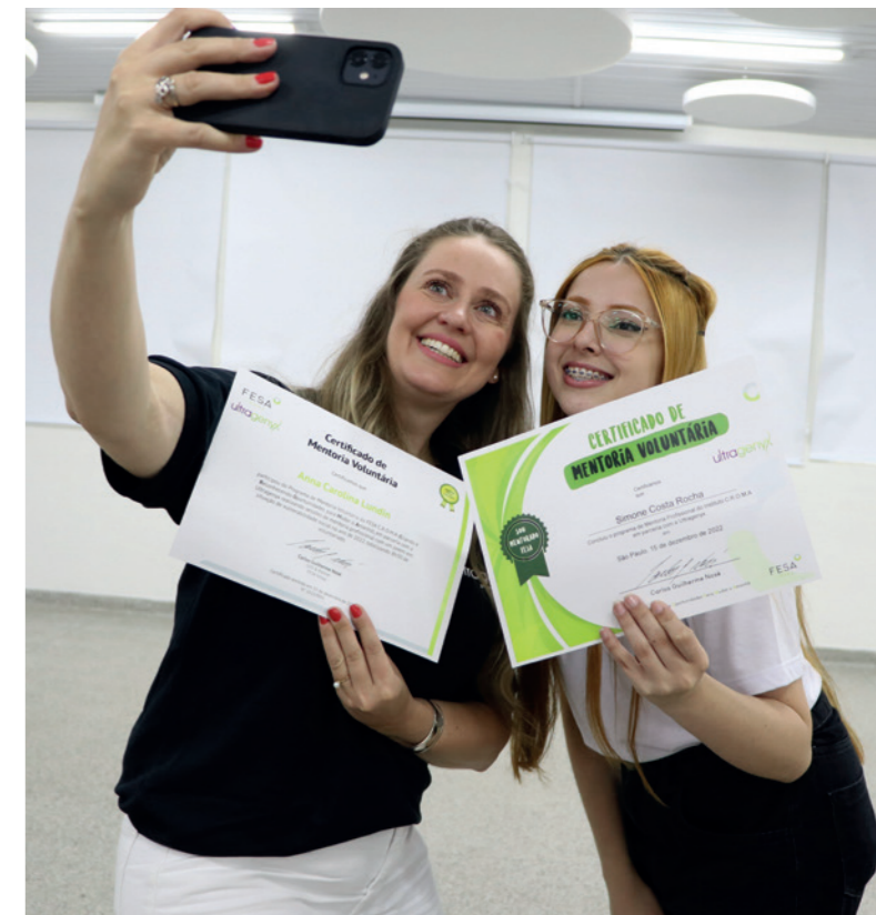
Partner companies carry out activities with young people

Partner companies are also fundamental to Unibes’ actions, supporting its social programs and contributing so that many activities that provide enriching experiences can be conducted. Resources reach Unibes through sponsorships, project financing, partnerships and donations of products and services. Among the activities developed by the area, the highlight is the continuous building of relationships and sensitization of potential funders. This is a fundamental role for project alignment, in addition to the development of communication channels that ensure the image, values and seriousness of Unibes.