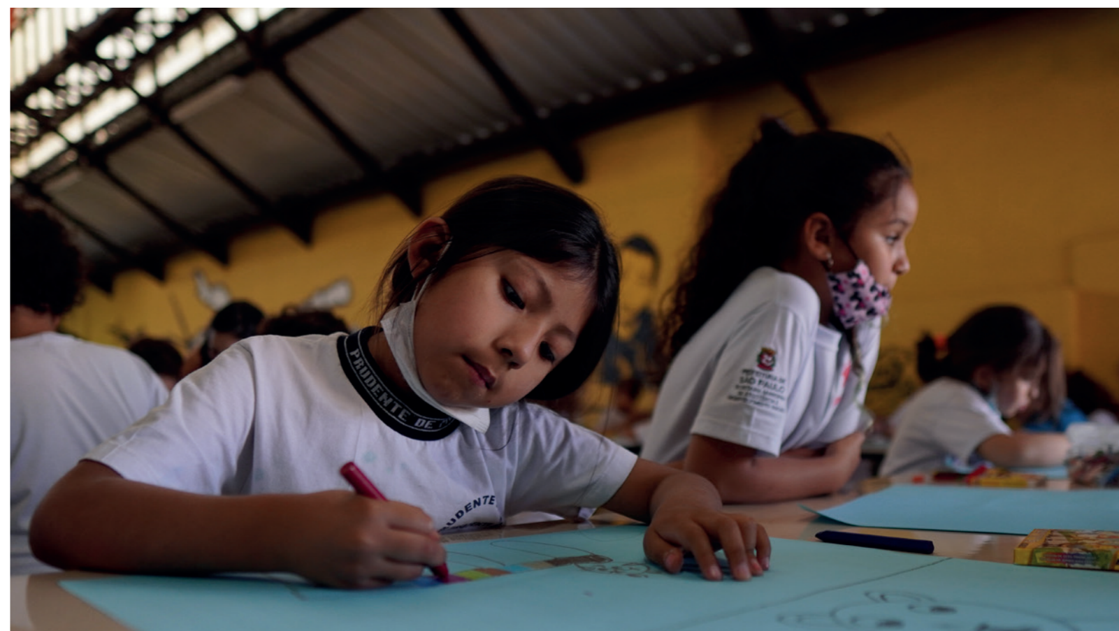
Children participating in a recreational workshop