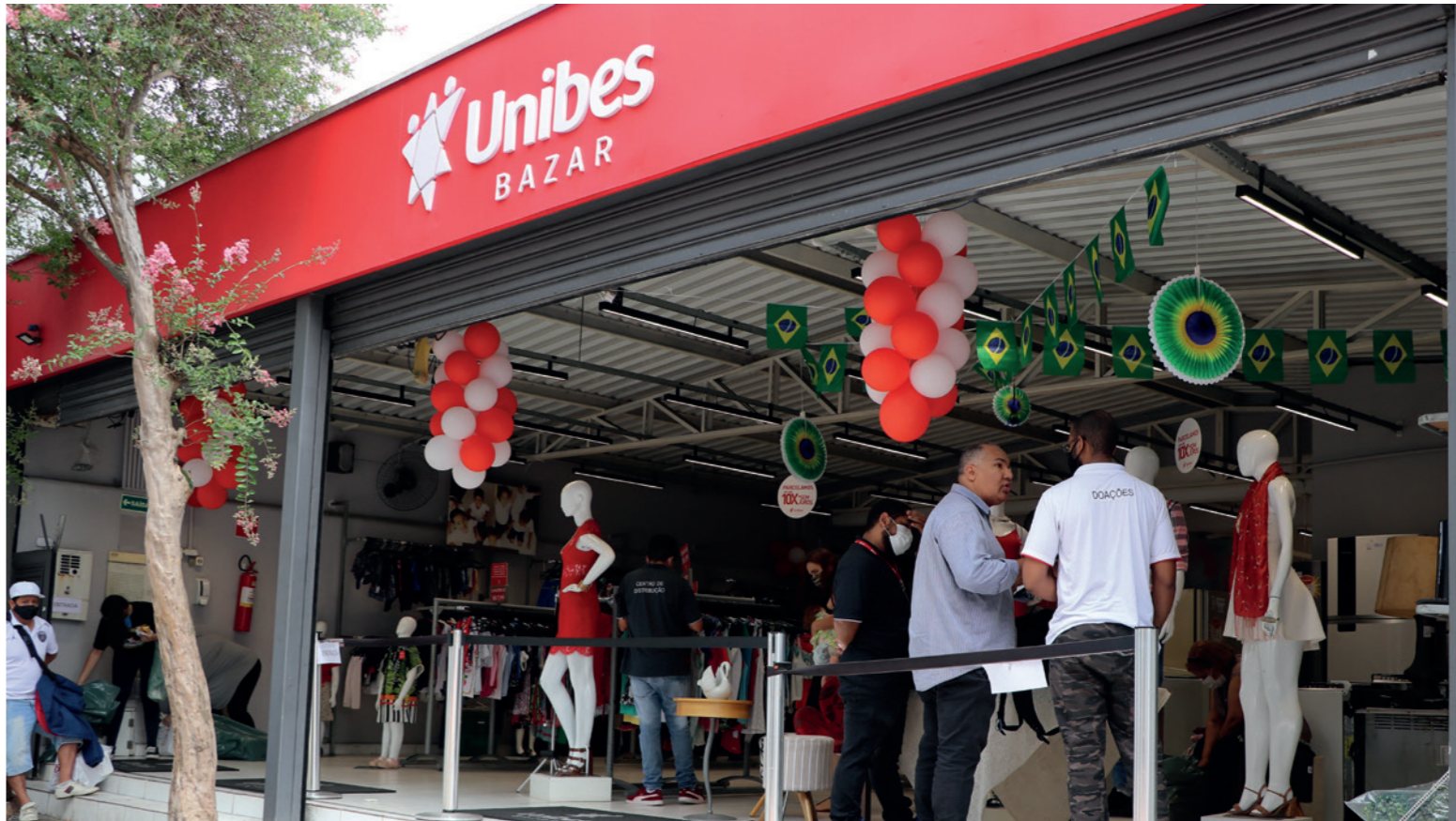
Unibes Bazar store – Bom Retiro