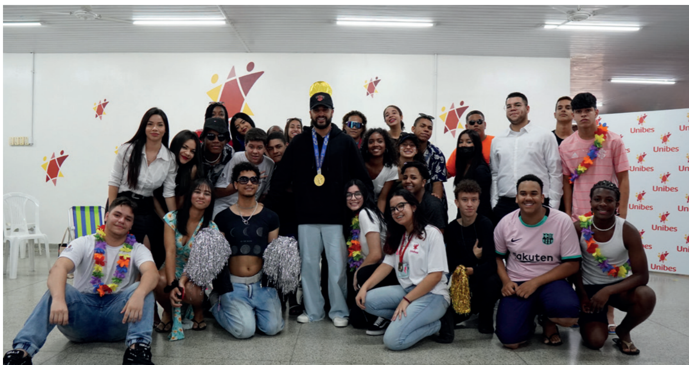
Lecture with Olympic surf champion Italo Ferreira and below young people at an art exhibition

In 2022, the students in the vocational courses were able to participate in meetings, lectures, mentoring, among other actions that serve as a learning tool and inspiration for these young people who are building their trajectory in the job market. Two of the many inspiring testimonials that the students heard this year were from the CEO of Amil, Edvaldo Vieira, and the Olympic surfing champion Italo Ferreira.